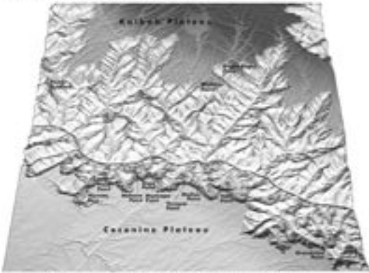
Blick nach Norden über den Grand Canyon Südrand am 01.07. um 12:30 Uhr