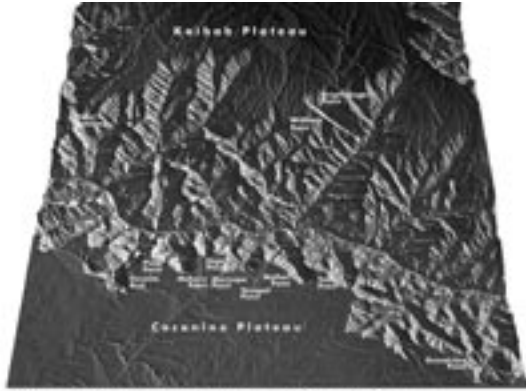
Blick nach Norden über den Grand Canyon Südrand am 01.07. um 06:00 Uhr, Sonnenaufgang um 05:19 Uhr