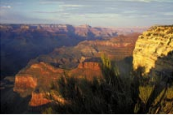
Evening atmosphere at Hopi Point

Kaibab National Forest covers both plateaus. In general, there is a 10 °C (18 °F) temperature difference between the south and north rims. On the way down to the bottom of the canyon, it gets warmer by an average of 5.5 °C per 1,000 ft (3 °C per 1,000 m).