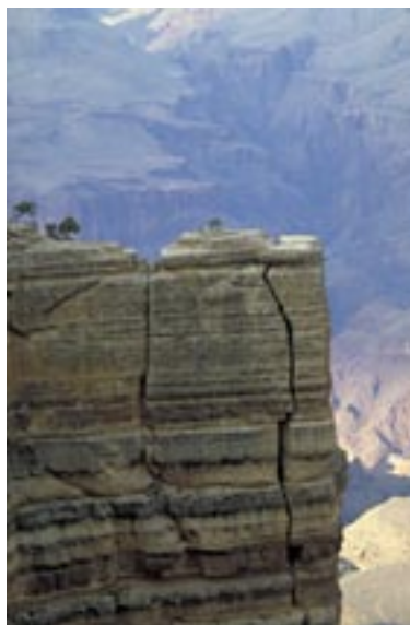
Playing with the depth of field gives images of wide landscapes, such as the Grand Canyon, an additional sense of depth.

The canyon interior is the third major area of the National Park, along with the North and South Rims, and unless you're taking an inflatable boat from Lees Ferry, the only way to reach it is on foot. Several trails lead down from the North and South Rim. All of these trails share the common feature of bridging a significant altitude difference of more than 1000 m (3,280 ft) over the stretch of more than 10 km (6.2 mi), which in turn places significant demands on your personal fitness. The basic equipment includes food and at least 2 liters of water, both of which you should consume. In the Visitor Center, you can get detailed information about possible dangers and precautions. On the way, provided you have a Backcountry Permit, you can camp in specially designated areas of the park, called use areas. But just like overnight accommodations at Phantom Ranch at the canyon bottom, the number of permits is limited; usually the number of applications doubles the permits issued. Reservations for Phantom Ranch also run up to a year in advance. However, there are a not inconsiderable number of cancellations, and thus at least a chance for a short-term bed.