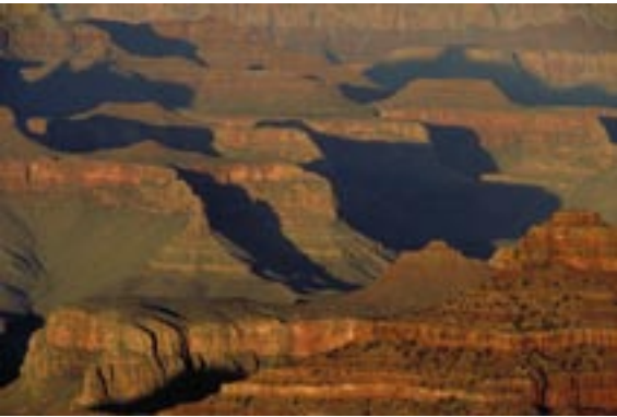
Shadows give images of vast landscapes, such as the Grand Canyon, their true depth.

The first morning light illuminates the reddish-yellow limestone just below the fault line. Gradually, the multicolored layers in the depths become visible. The second half of the day reverses this spectacle, with shadows creeping back to the surface, engulfing colors and details until night fills this vast scar black.